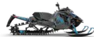
M 8000 MOUNTAIN CAT ALPHA ONE