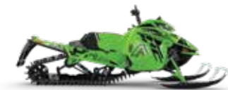
M 8000 HARDCORE ALPHA ONE